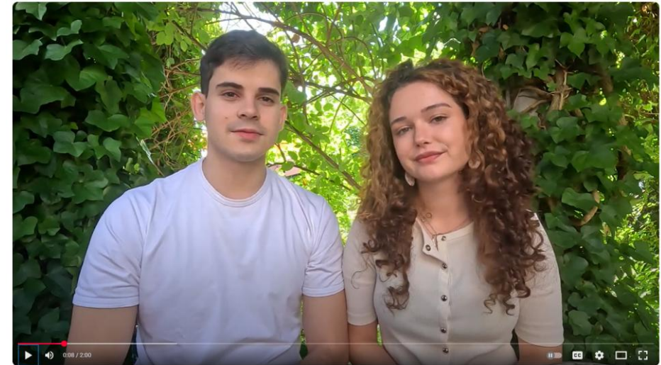
Twice abroad - exchange stories from international students at the University of Ljubljana

https://www.youtube.com/watch?v=spYLLCULJ4A